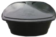
POLYTANK® KING KONG